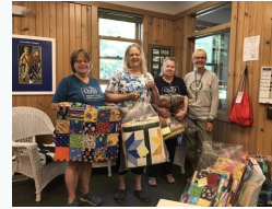
Bay Cliff Health Camp 2023

MCQA members believe in using our resources to give back to our community. Each year we sew quilts of all sizes for all ages, wall quilts, and other items. We donate our work to local organizations such as Bay Cliff Health Camp, Trillium Hospice House, Room at the Inn, the Neonatal Intensive Care Unit (NICU) at UP Health System, and other local charities.