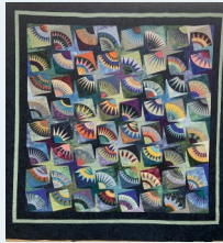
Raffle quilt for Autumn Comforts quilt show in 2021

The Marquette County Quilters' Association (MCQA) began in 1978, when a group of parents from Silver Creek Elementary School in Marquette, Michigan, decided to make a raffle quilt to help pay the medical expenses of a local boy who had been injured in a house fire. The group so enjoyed their time together, working and talking about quilting, that they decided to organize a group to meet regularly. They arranged a meeting place and set a date for the first meeting of the MCQA. Twenty enthusiastic quilters attended that very first meeting. More than 40 years later, MCQA remains a vibrant, enthusiastic group of quilters from all over the Marquette area. Join us. All skill levels welcome!