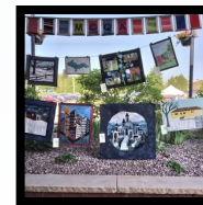
Art Week 2023